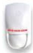
RF PIR Quad motion detector with 15m range and adjustable sensitivity. No sleep time.