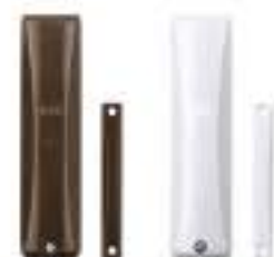
RF Contact w/Inertia Wireless contact with inertia sensor complete with wired Aux alarm and tamper inputs.