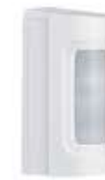
VXS-RAM VXS-RDAM 180-degree panoramic outdoor detector.