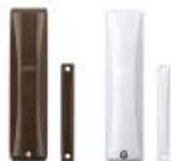
RF Contact (Std) Standard size contact with wired Aux alarm and tamper inputs.