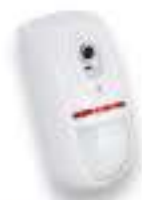
RF PIR Cam RF PIR camera with 15 m detection range & adjustable sensitivity. (requires SecureComm connection)