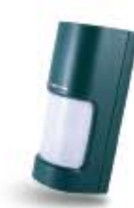
WXI-R 180-degree panoramic outdoor detector.