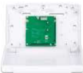
RF Expander RF Expander acts as a range extender for all wireless devices. Up to 15 units can be wired to the keypad/expander bus or added wirelessly to SW10270.