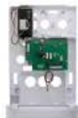
RF Smart PSU The RF SmartPSU delivers 12Vdc at 2A. Up to 15 units can be wired to the keypad/expander bus or added wirelessly to SW10270. Acts as a range extender for all wireless devices. 2 fully programmable changeover relays.

The HKC RF-Optex module connects a range of Optex external detectors to the HKC SW 10270 panel.