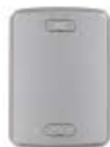
RF RBX Wireless Relay box with 2 changeover relays allows control of third party devices such as gates, lights, heating and arming CCTV systems etc. Can also be used in standalone mode when connect to RF-AK7.