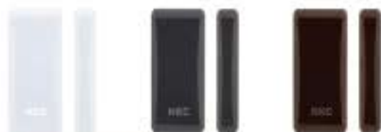
RF Contact (Min) Extra Slim range of wired devices which are designed to fit onto the smallest of door and window frames without any compromise.