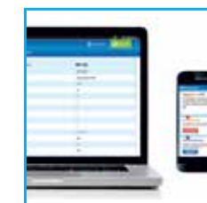
Engineer App and Software (Smartlink700)