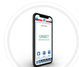
HKC App (Alarm User)