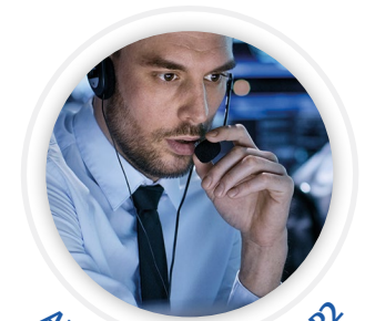
ARC Monitoring SP3 / DP2