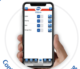
Control CCTV, Gates & Heating